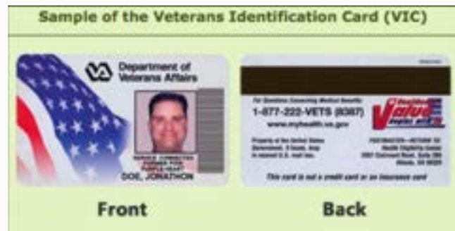
Veterans (discount card – not tax exempt)