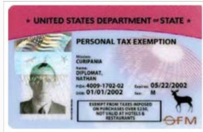
Federal ID Card (Tax Exempt does not require THD Registration)

Please clip your card below and use for your store tax exempt purchases.