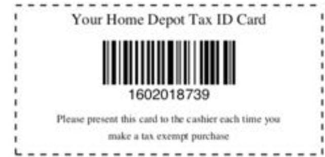
THD Registration Card (requires cut out – no lamination)

Please clip your card below and use for your store tax exempt purchases.