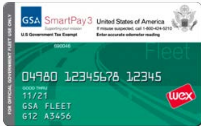
GSA Card – Tax Exempt (doesn't require THD registration)